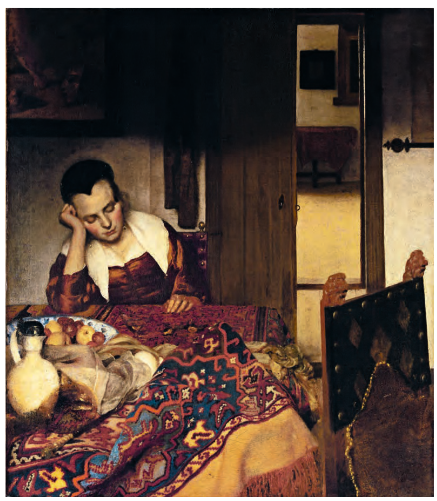
CAT. 5 A Maid Asleep c. 1656–1657