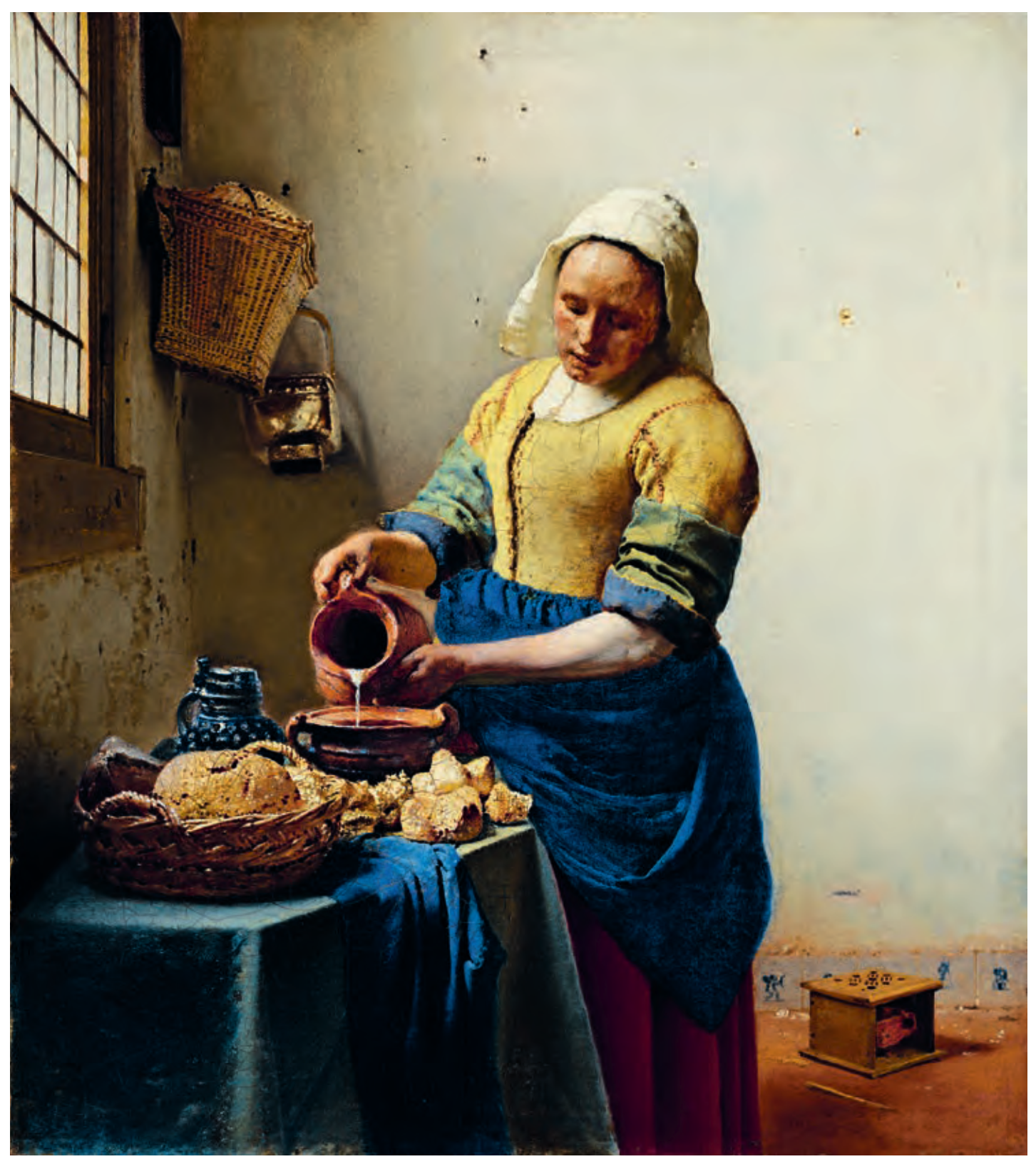
CAT. 8 The Milkmaid c. 1658–1659