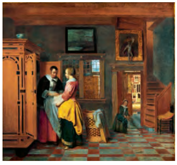
FIG. 13 Pieter de Hooch, Interior with Women beside a Linen Cupboard , 1663 Oil on canvas, 70 \times 75.5 cm. Amsterdam, Rijksmuseum, inv. no. SK-C-1191; on loan from the City of Amsterdam

Immediately adjoining the great hall was a small room whose location was described by the notary's clerk as the 'small room next to the aforementioned great hall'. This also contained a fireplace adorned with a green mantelpiece coverlet. The furnishings of the room were modest. There were only two paintings and a worn mirror on the wall. This intermediate space has indeed been characterized in the art history literature primarily as a storage place for old things. And in fact the 'rack', the 'green-painted wooden coffer with iron fittings' and the 'large, tall, tin container' must have