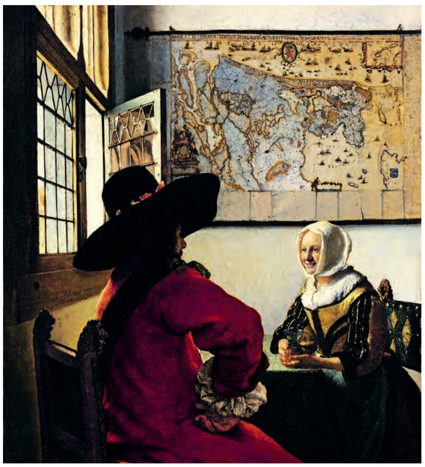
CAT. 7 Officer and Laughing Girl c. 1657–1658