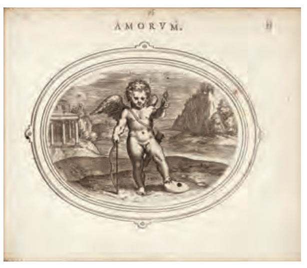
FIG. 2 Cornelis Boel, 'Inconcussa fide' (Sincere), emblem from Otto van Veen, Amorum emblemata , Antwerp, 1608, p. 55. Engraving, 151 × 202 mm Amsterdam, Allard Pierson, University of Amsterdam, OK 63-5938

In the painting on the left in the background, which is only partly visible, all that can be seen is the leg of a child and in front of it an upright mask; lying flat on the ground is a second mask, which has been transformed (in a restoration?) into a pile of debris. Because the picture is only shown in part, the masks are the sole elements that can be regarded as pictorial motifs significant for the depiction as a whole. Traditionally regarded as signs of deception and falsehood, they complement what is and what has been going on in the foreground. But it is left up to the viewer to establish some