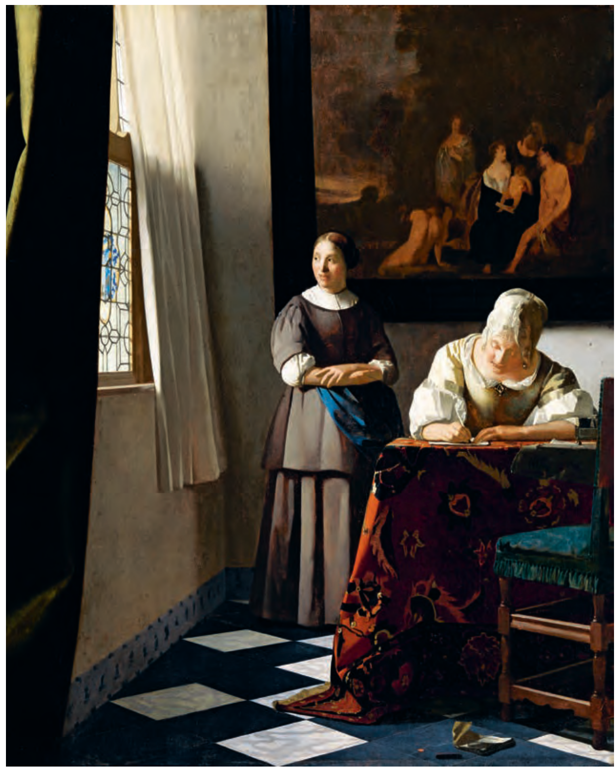
CAT. 35 Woman Writing a Letter, with her Maid c. 1670–1672