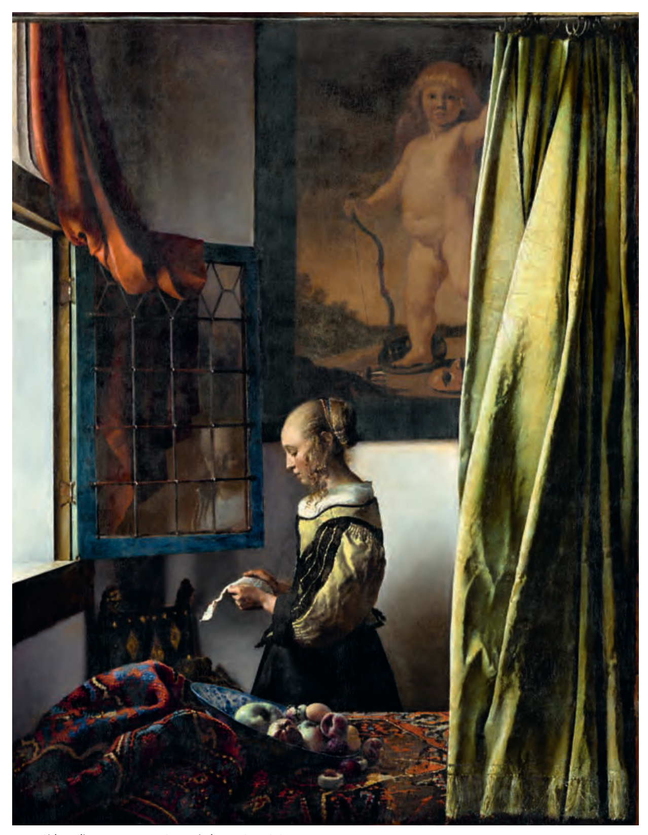
CAT. 6 Girl Reading a Letter at an Open Window c. 1657–1658