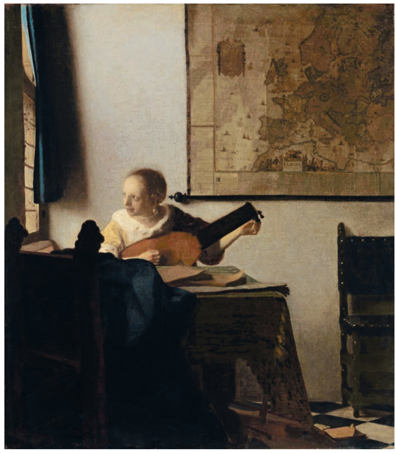
CAT. 18 Young Woman with a Lute c. 1662–1664