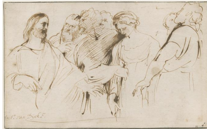
Van Dyck after Titiaan, Christ and the Woman Taken in Adultery , c. 1622-1623, 137 x 221 mm, MPM, PK.OT.00120