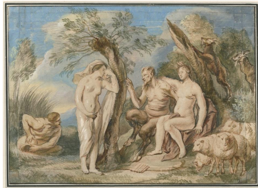
Jordaens, Psyche Consoled by Pan , 1640, 282 x 367 mm, MPM, PK.OT.00163