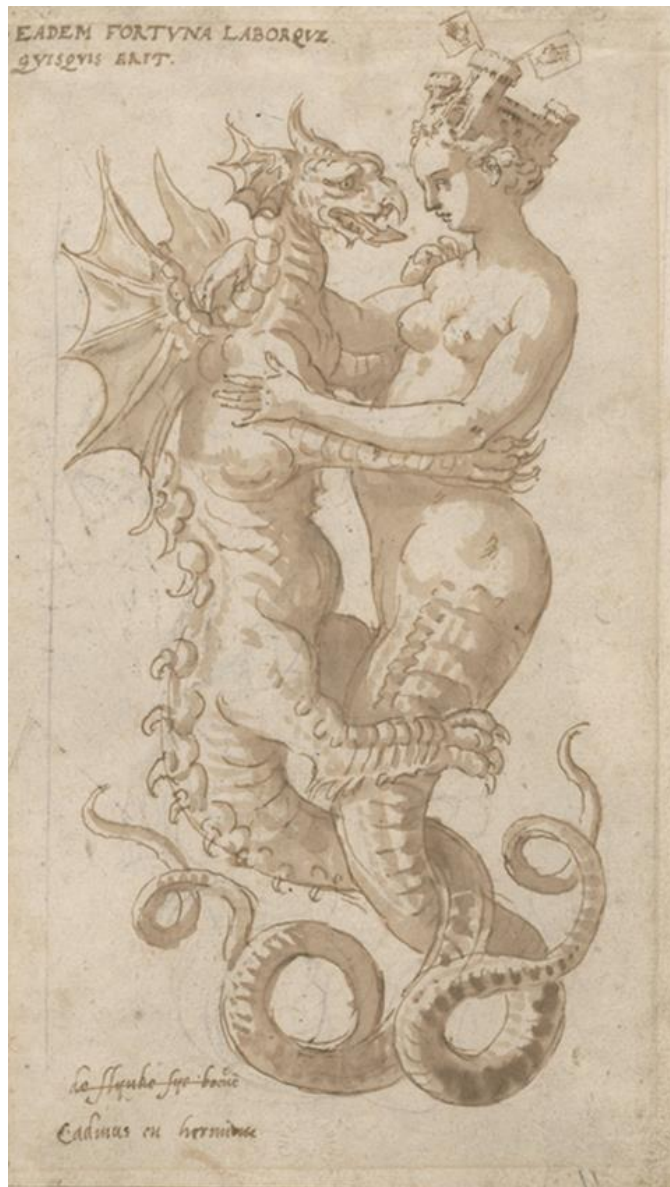
Maerten de Vos, Design for a decoration for the Joyous Entry of Archduke Ernst of Austria in 1594 , 1593-1594, 343 x 194 mm, MPM, PK.OT.00058