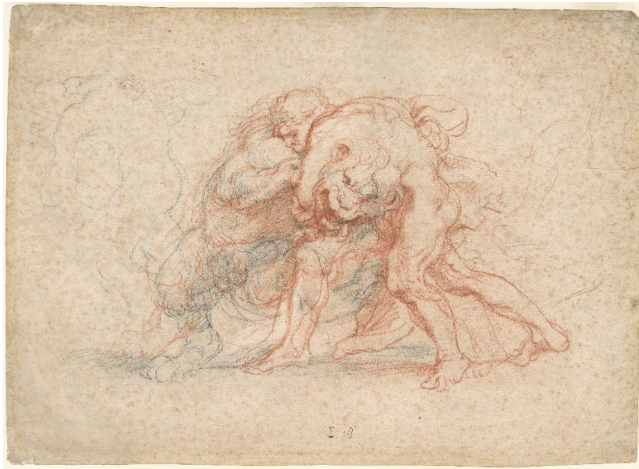
Rubens, Hercules and the Lion of Nemea , 1613-1614 or after 1630, 363 x 498 mm, MPM, PK.OT.00110