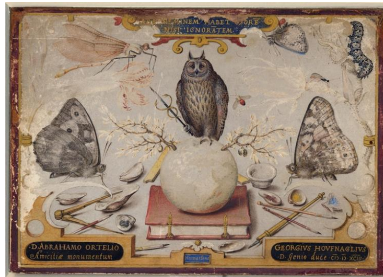
Joris Hoefnagel, Allegory for Abraham Ortelius , 1593, 118 x 165 mm, MPM, PK.OT.00535