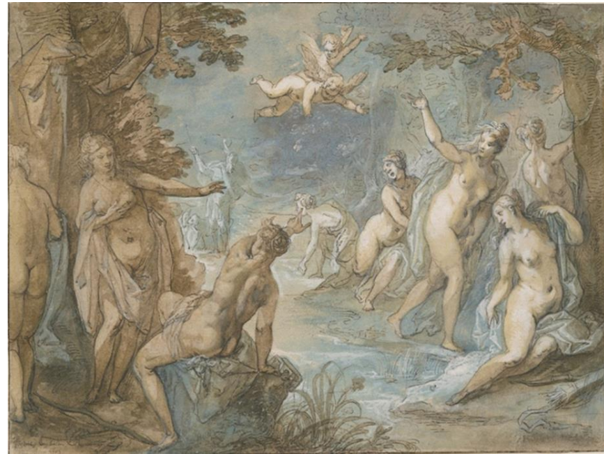
Hendrik van Balen, Diana and Acteon , 1605, 201 x 267 mm, PK.OT.00537