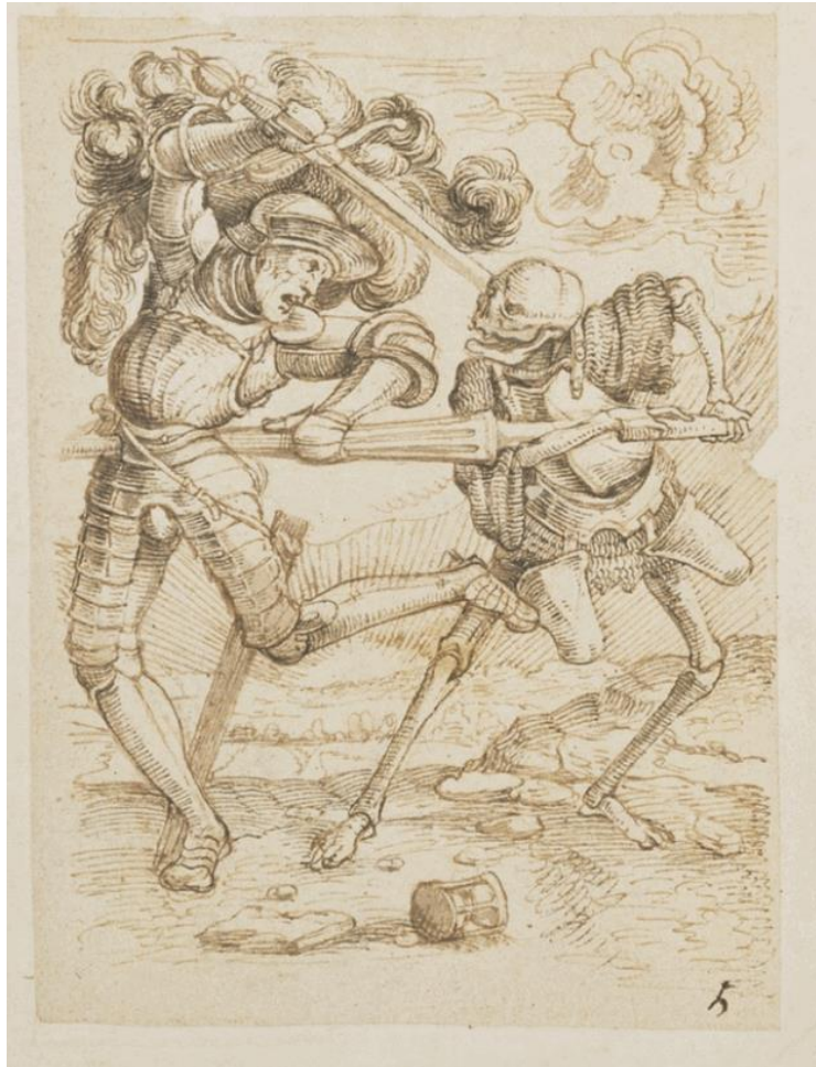
Rubens after Holbein, The Knight and Death from The Dance of Death , c. 1590, 99 x 72 mm (drawing album), MPM, PK.OSB.0192.005