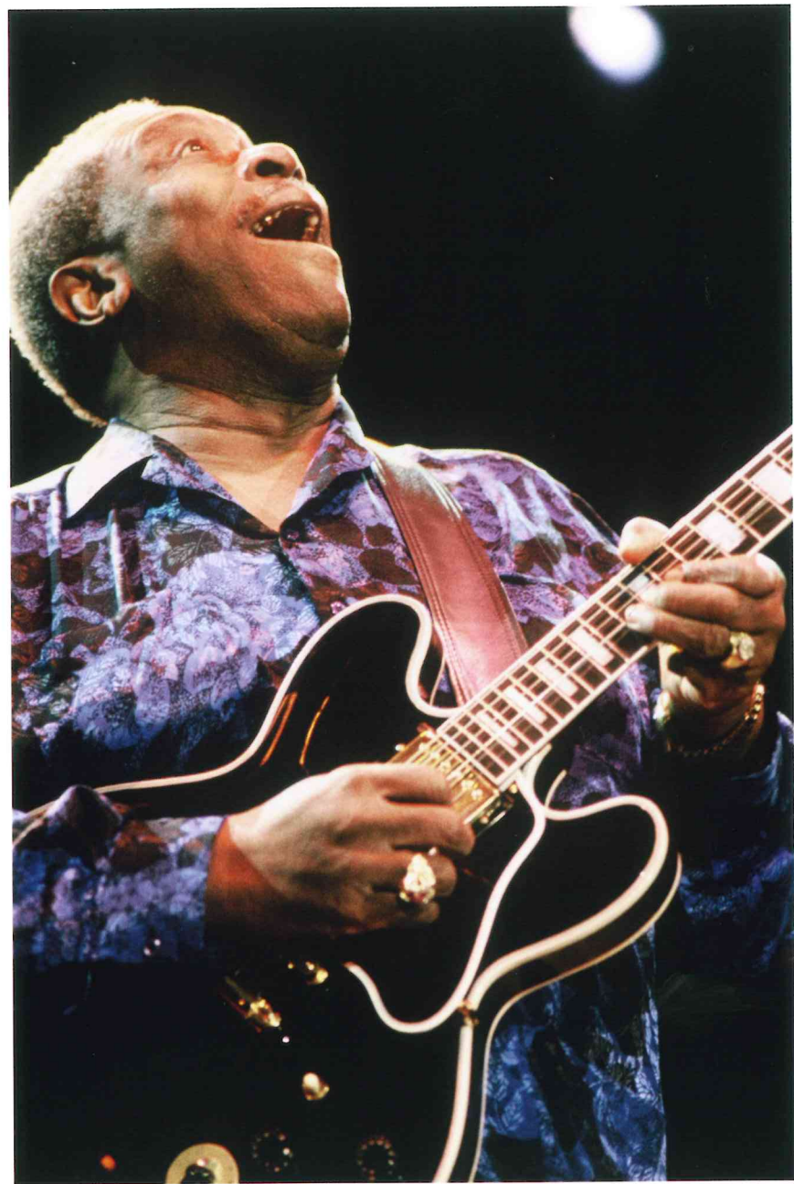
B. B. King Jazz Festival in Vienne, 1997