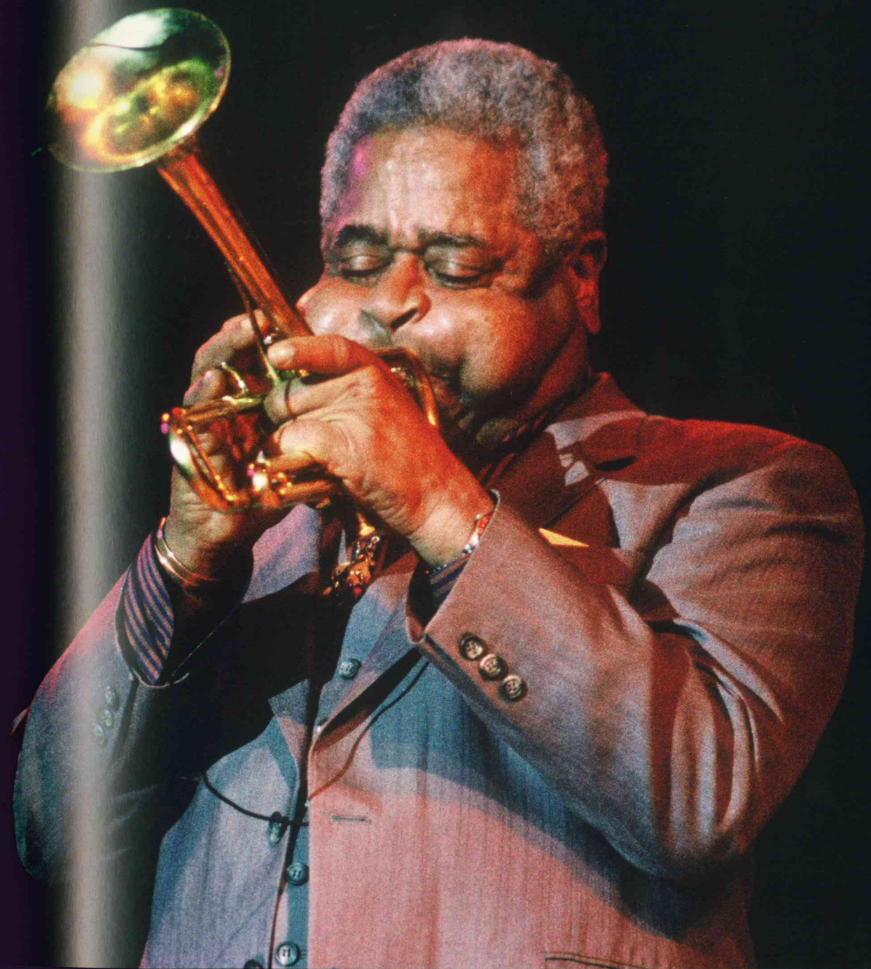
Dizzy Gillespie Jazz Festival in Vienne, 1988