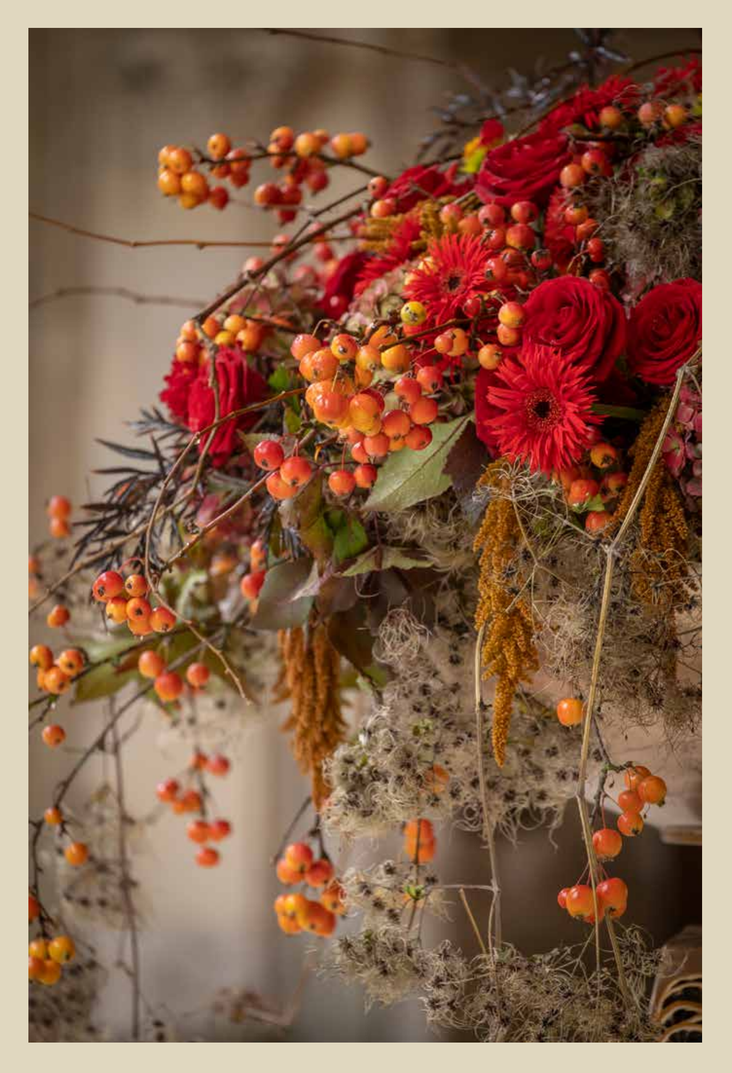
Le Bec-Hellouin, nous sommes dans le cloître de l'abbaye du Bec-Hellouin, un grand moment solennel de recueillement, dans un des plus beaux villages de France. / Le Bec-Hellouin, inside the cloister of Bec-Hellouin Abbey, a solemn moment of meditation in one of France's most beautiful villages.