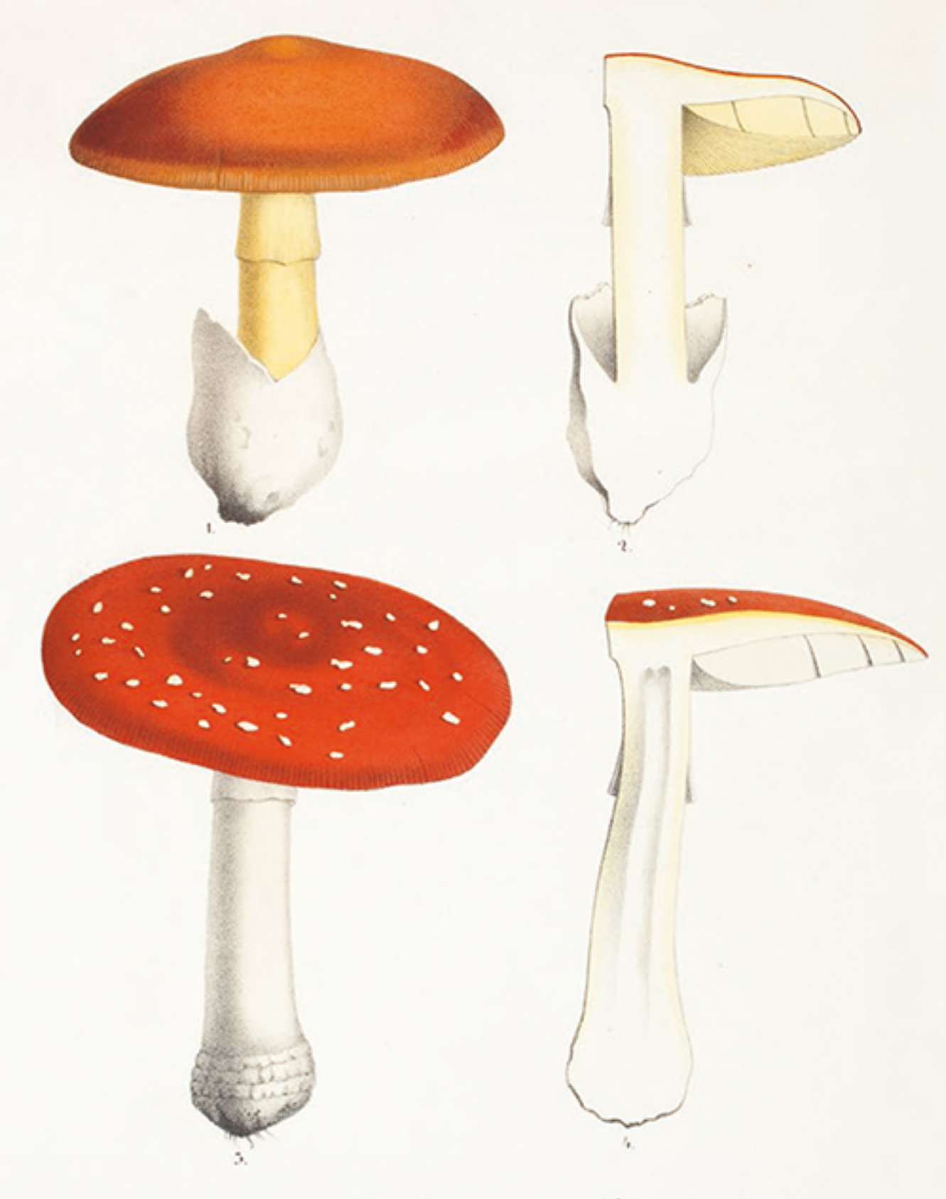
1.2. Agaricus caesareus Scop. 5.4 Agaricus muscarius Linn.