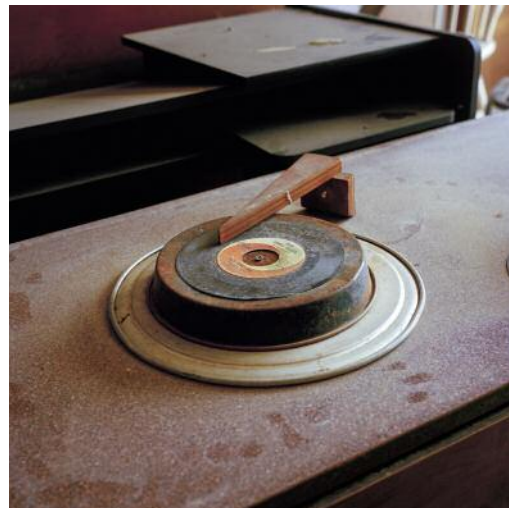
10 © Christopher Sims