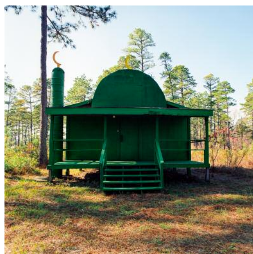
06 © Christopher Sims