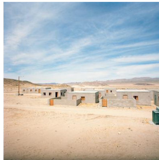
12 © Christopher Sims