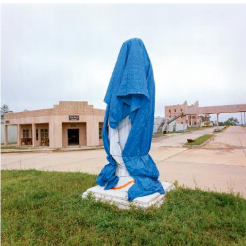
11 © Christopher Sims