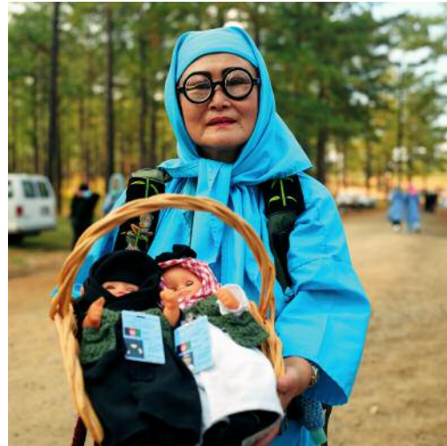
08 © Christopher Sims