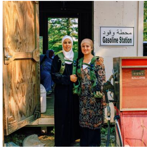
04 © Christopher Sims