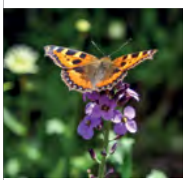
"The Cotswold Way is a classic English long-distance trail, following the western edge of the Cotswolds from Chipping Campden to the Roman city of Bath."