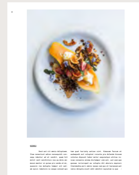
PHOTOGRAPHY: JESSIE LEE PERSONAL PROJECT

Story On A Plate introduces world renowned chefs and food stylists who guide you through the process of plating, step-by-step, from main dishes and appetizers to desserts. Story On A Plate opens up this gastronomic art form for both the amateur chef at home and the pro, and allows you to imaginatively and skillfully serve your own culinary creations.