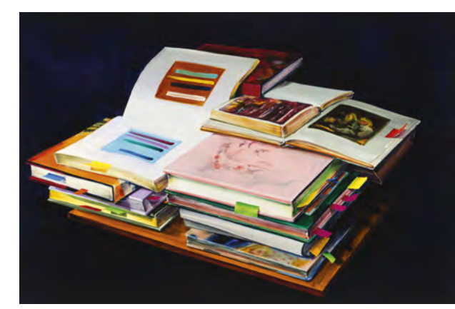
Stripes, 2019. Oil on canvas, 200 x 30 cm