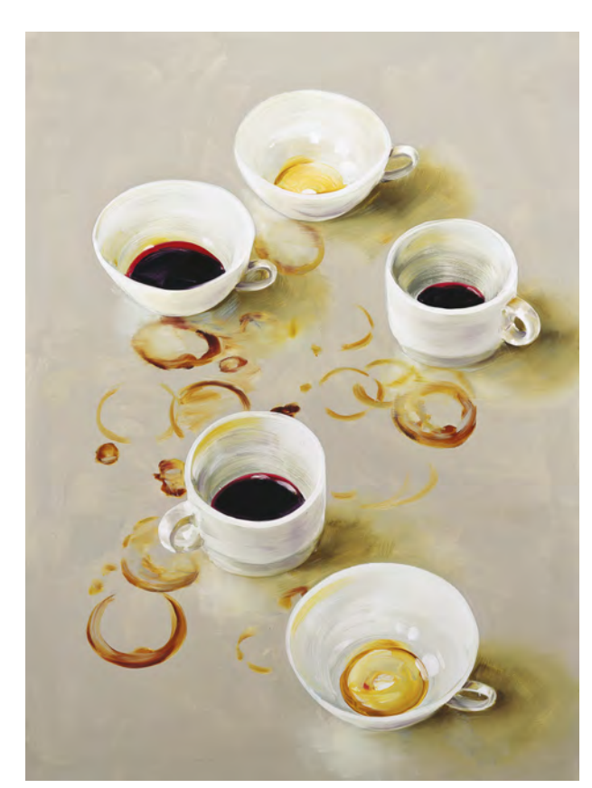
Cups, 2016. Oil on canvas, 190 x 40 cm