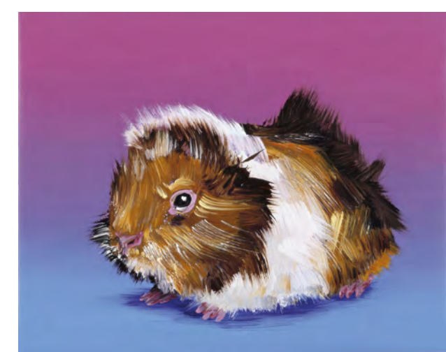
Guinea Piq, 2003. Oil on canvas, 40 x 50 cm