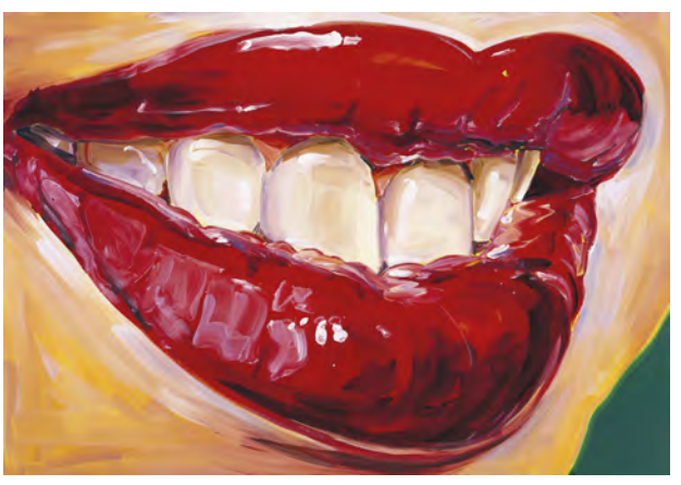
Lips, 2011. Oil on canvas, 190 x 275 cm