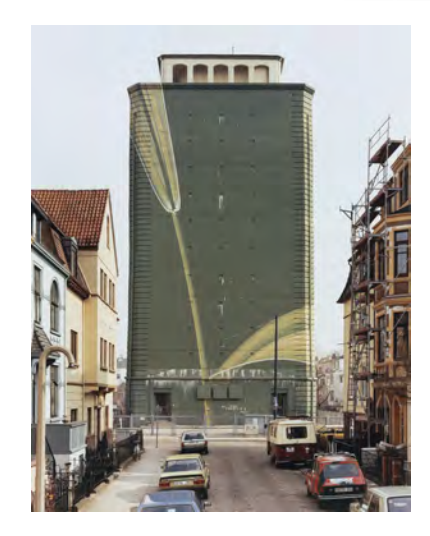
Boris Becker: Bremen, Hardenbergstraße, 1987, from the High-rise Bunkers series