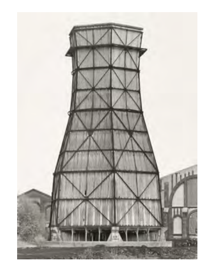
Bernd and Hilla Becher: Cooling Tower, Waltrop coal mine, 1982