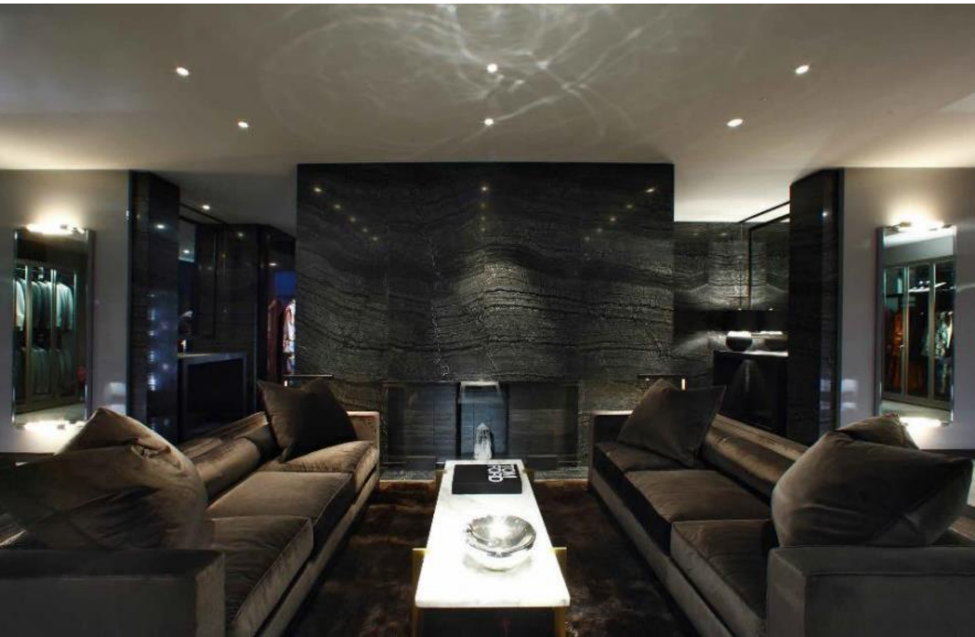
Tom Ford 002 • $135 • Hardcover • Oct 2021 • 9780847864379 • 10-3/4 x 14 • 416 pp