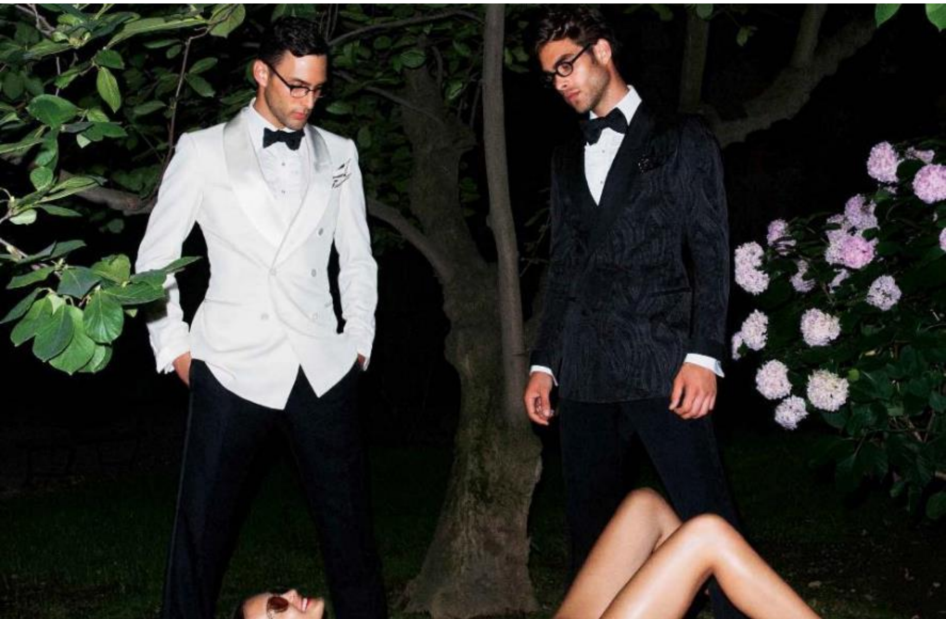
Tom Ford 002 • $135 • Hardcover • Oct 2021 • 9780847864379 • 10-3/4 x 14 • 416 pp